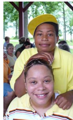
Mentee and son enjoying the mentee/mentor picnic