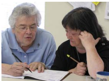
Tutoring at the Center