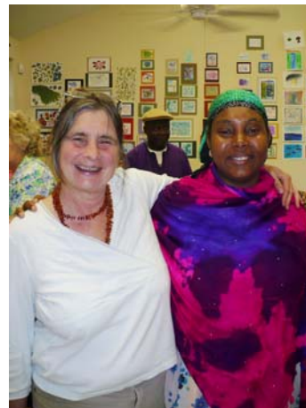
Art Day at the Center