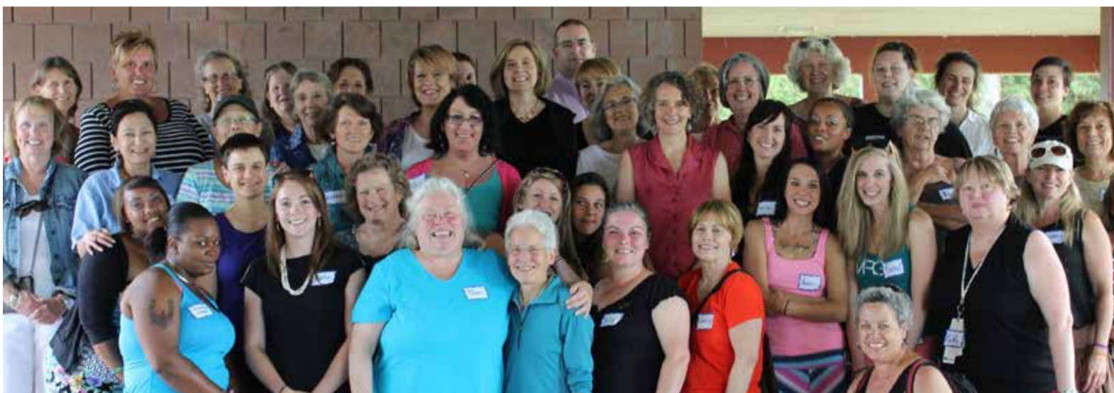
Annual Vermont Women's Mentoring Program Summer Picnic Celebration